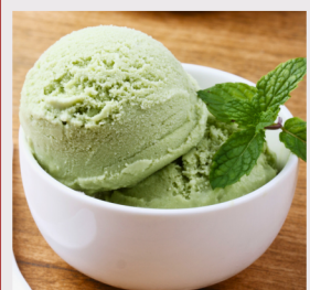
DISHII ICE CREAM