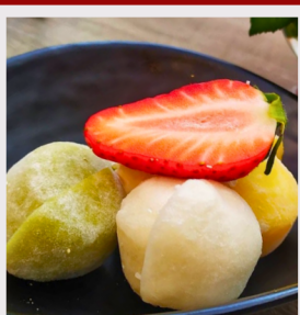
MOCHI ICE CREAM